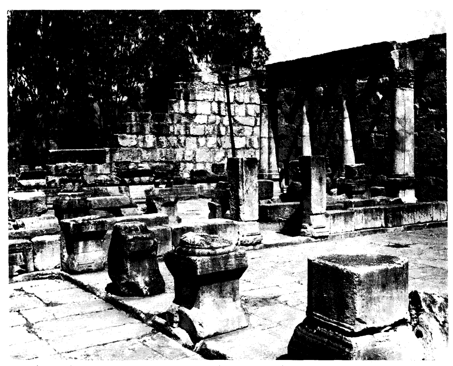
An inside view of the Capernaum synagogue. Though small, this was one of the largest synagogues in all Palestine.